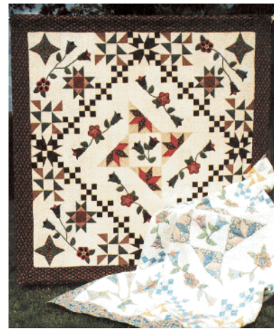
Pathway to Patchwork by Beth Ferrier